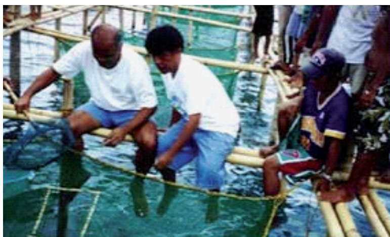
• Tubigon fisherfolk working hard for the Mariculture Project