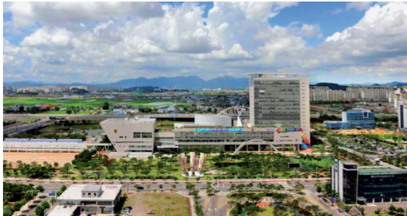
• Gwangju City's industries take steps to mitigate and adapt to climate change

The initiative is a creative policy that actively engages citizens for the protection of the Earth.”