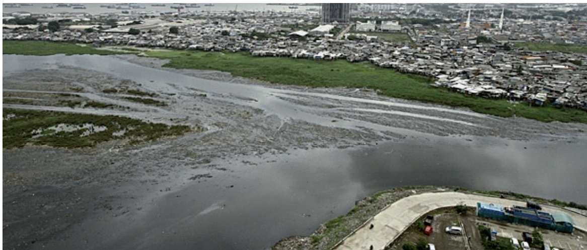
• Pluit Reservoir in danger of overflowing with heavy sediment

invited to talk and discuss with the Governor so that the communication could be active and a two-way process. Citizen engagement was a key component to the success of the project since a major challenge was relocating the people to the new legal subsidized housing.