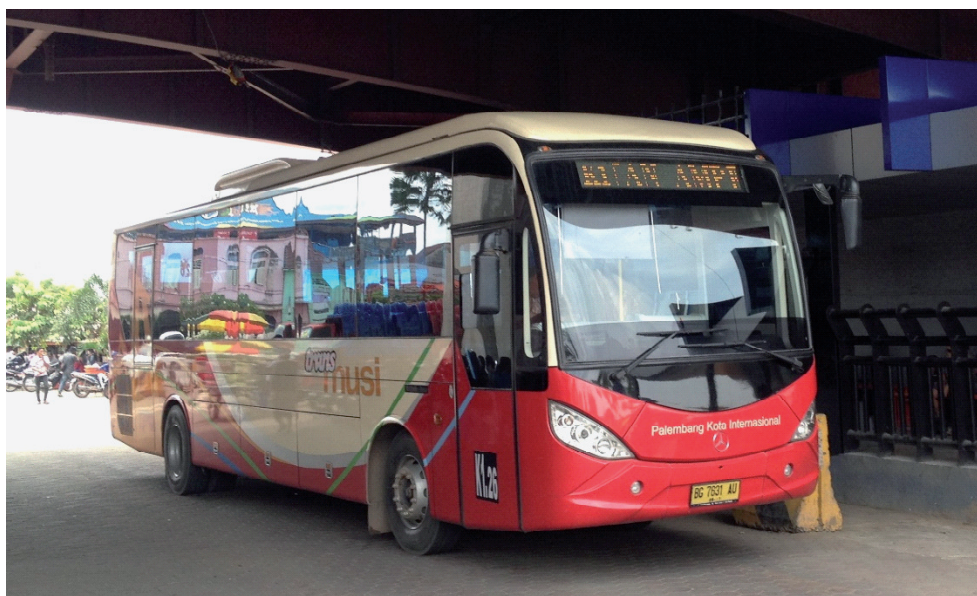
• Palembang Green Urban Transport Project

CDIA supported the City of Palembang to bridge the gap between the city's transport plan and actual investment in transport infrastructure projects. Activities included a comprehensive sector review and pre-feasibility study with focus on urban transport, infrastructure