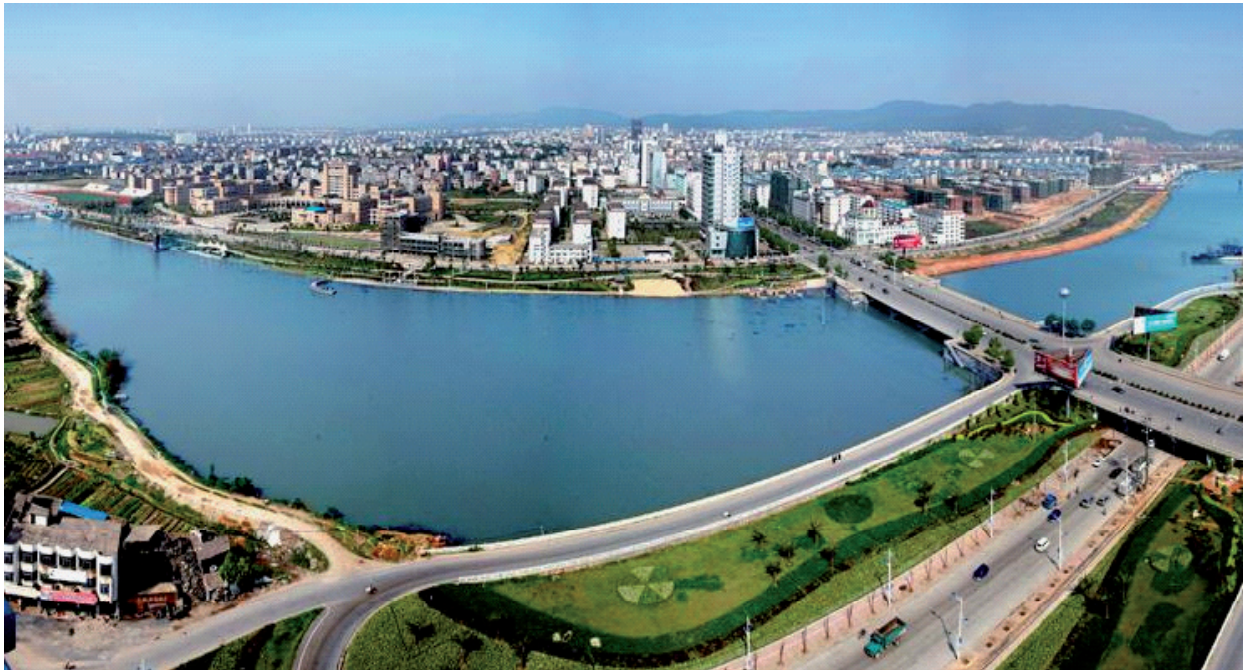
• The Xinyu Kongmu River Flood Control and Environmental Management Project

for up to 3 days in 2010 - the worst flood Xinyu had to face in the modern Chinese period, with the evidence that climate change is beginning to affect the city.